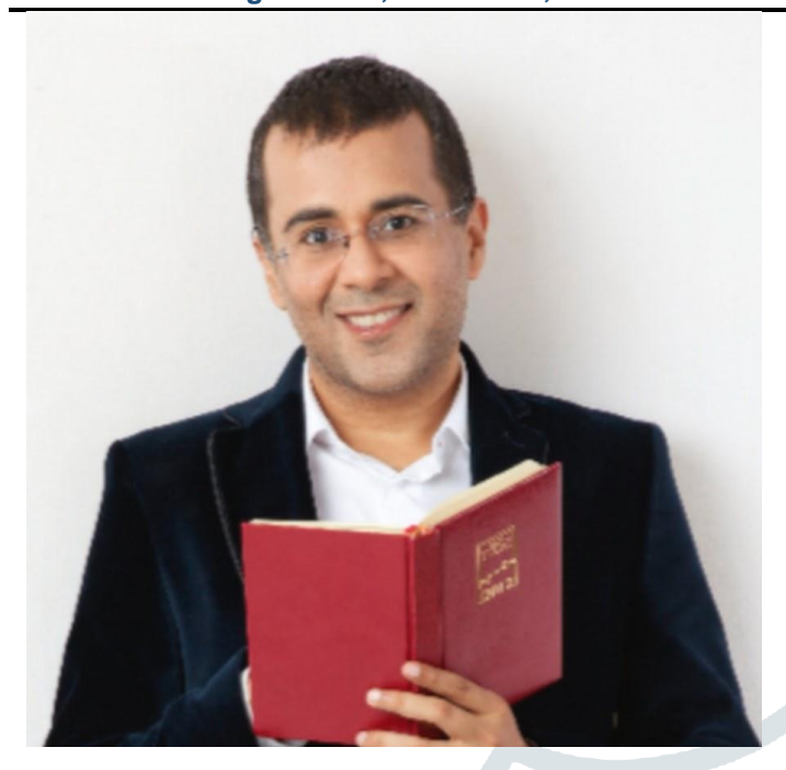
Fig 1.1: Chetan bhagat