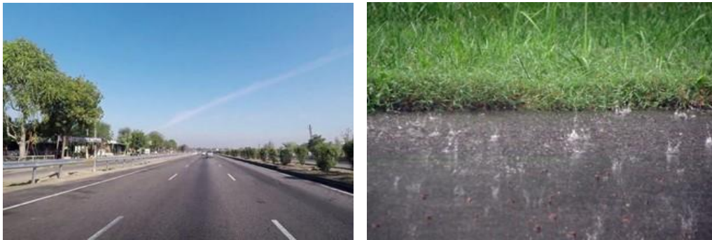
Fig 1 Asphalt Mix Road in Rain and Sun

Figure 1 shows two aggregate samples from the same source after they have been coated with asphalt binder. The asphalt binder used with the sample on the left contain no anti-stripping modifier, which resulted in almost no aggregate-asphalt binder adhesion. The asphalt binder used with the sample on the right contains 0.5% (by weight of asphalt binder) of an anti-stripping modifier, which results in good aggregate-asphalt binder adhesion.