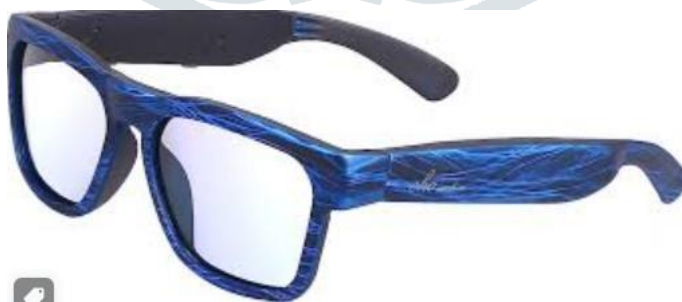
FIGURE 2: Voice-controlled smart glasses