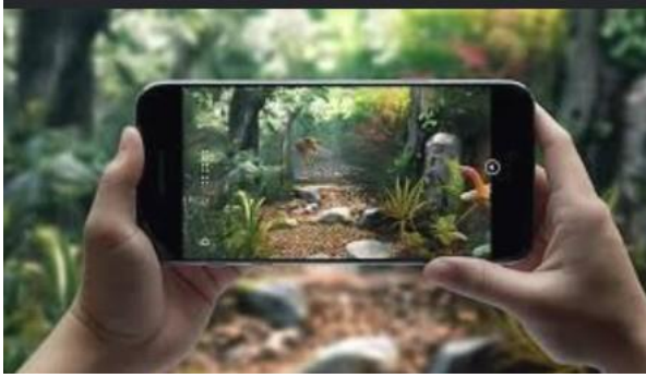
FIGURE 3: Augmented reality technology

glasses (Smith, 2020). Our method of data analysis included a multifaceted examination to ensure that both quantitative and qualitative factors were carefully considered. We were able to develop a complete picture of the effects and consequences of smart glasses in the workplace thanks to this thorough investigation. Our study presents a well-rounded view that illuminates this technology's quantifiable benefits and subtle human experiences by combining statistical rigor with qualitative depth.