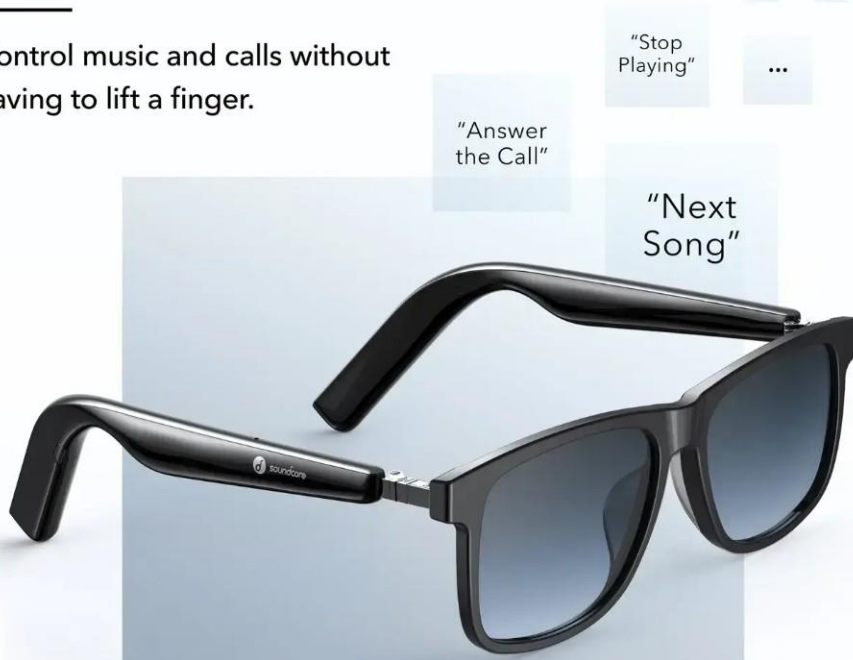
FIGURE 1: Voice commands for Voice-controlled smart glasses

Control music and calls without having to lift a finger.