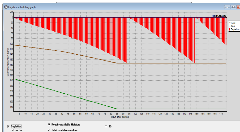
Figure 4.1 Graphical representation of irrigation scheduling for sorghum