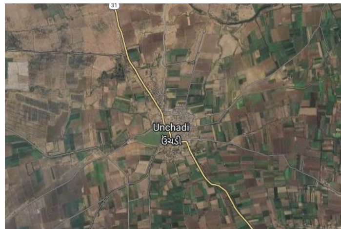
Figure 2.1 Google imaginary map showing the study area

Unchadi village, situated within Talaja Taluka, Bhavnagar District, Gujarat State, serves as the focal point for this research. Positioned 67 kilometres to the south of Bhavnagar's district centre, the village boasts an elevation of 65 meters above sea level. Unchadi's predominant crops encompass wheat, onions, bananas, cotton, sorghum, millet, and brinjal.