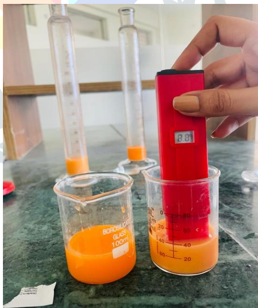
Figure 2 - pH determination test

pH of the suspension was determined using a pH meter. Firstly 30 ml of the sample was taken in a 50 ml clean and dry test tube. After that, the pH electrode was dispersed in a test tube and shaken gently. Observed pH after 5 minutes.