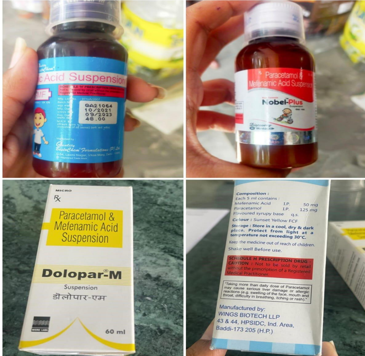
Figure 1- Suspension sample used