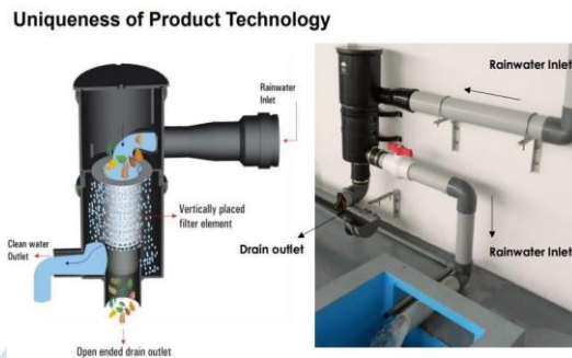
Fig.3 Arrangement of Rainy Filter

Provide educational resources, workshops, and outreach programs to raise awareness about water conservation practices and encourage sustainable behaviors among building occupants. Engage tenants, residents, and facility managers in water-saving initiatives, water-wise landscaping practices, and responsible water use habits.