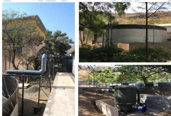
Fig. 2 Installation of RWH system at Infosys Pune by Using Technology

Implement rainwater harvesting systems to capture and store rainwater for non-potable uses such as landscape irrigation, toilet flushing, and cooling tower makeup water. Design rooftop catchment systems, gutters, downspouts, and storage tanks to collect rainwater runoff and supplement municipal water supplies.