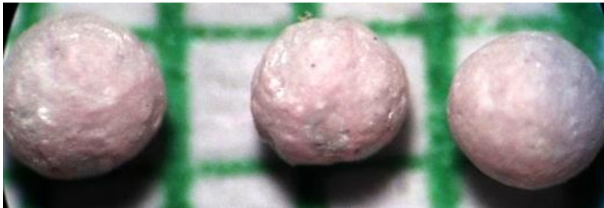
Figure 2: Reddish spherulite crystals of Struvite-K grown in manganese chloride.

However in Figure 2 , the different size of roughly spherulite crystals were observed. They are formed due to single nucleus either by an impurity of doping ions. As the local concentration surrounding of this nucleus is large, the growth takes place resulting in the formation of large spherical growth.