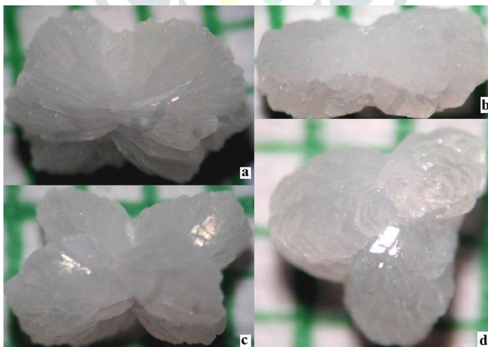
Figure 1: (a-d) Harvested Struvite-K crystals grown in manganese chloride.

The different morphologies such as translucent twins, x- shape, dumb-bell shape multiple faces dendritic as well as reddish color spherulites were observed under the stereo microscope. When the struvite-K crystals images of Mn 2+ doped compared to undoped sample [6], it was found that the manganese ions resemble the structure and found to affect the morphological growth of struvite-K crystals. This may be due to fact that the additive can affect the crystal growth rate by adsorbing onto the surface of a growing crystal or by altering solution properties [14].