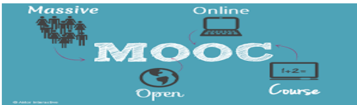
Figure 2. MOOCs Open Course

b) X-MOOCs: They have their background in the evolution of open courseware and open educational resources. X-MOOCs are generally offered by universities in collaboration with a commercial organization/company whose aim is to gain profit. X-MOOCs are online versions of traditional learning formats ie, lecture, instruction, discussion etc.