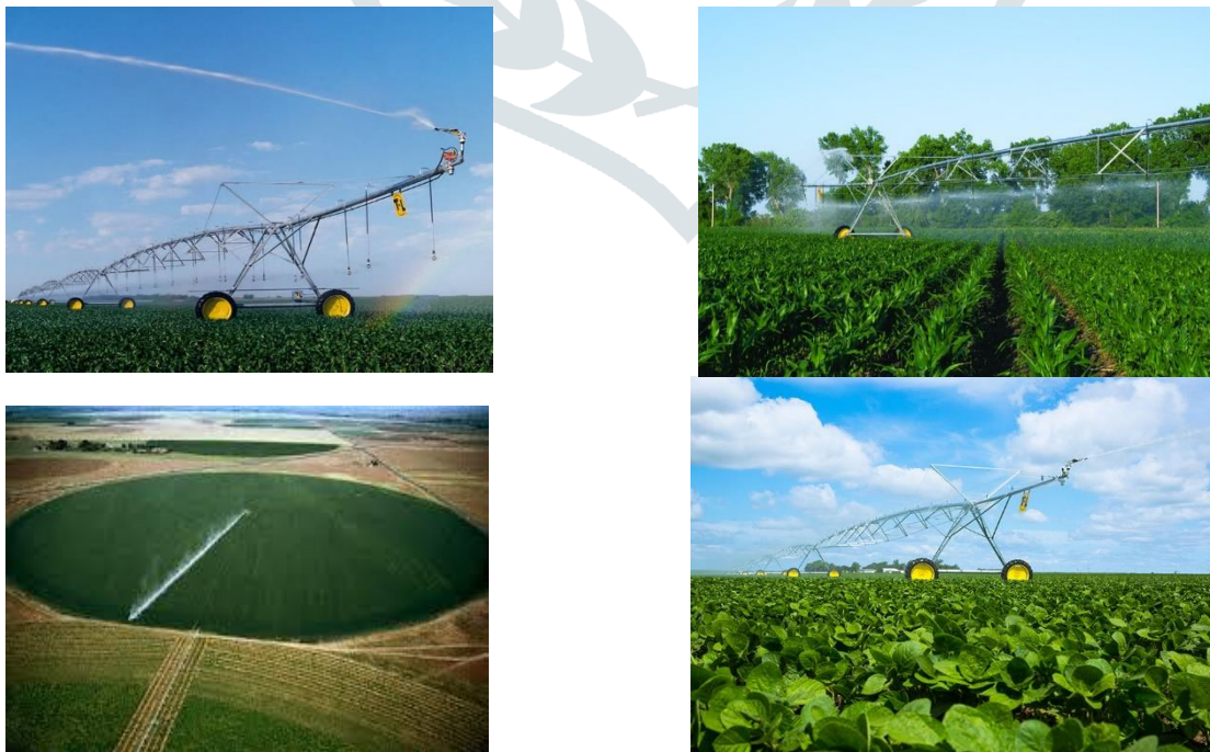
Fig1. Center pivot system

Irrigation is an indispensable practice in most agricultural systems and it is defined to be the artificial application of water to the soil for the reason of crop production. The mechanism of irrigation systems allows a flow of water to be redirected from its native place to be applied to farmlands for purpose of boosting water for growing crops and enhancing crop yields. The main irrigation method followed among country is surface irrigation. The main disadvantage by this traditional method of irrigation is that it needs more labor power compared to modern methods like a sprinkler and drip irrigation. These methods are highly beneficial to farmers as water losses are low and limited no of labor is sufficient to complete the task.