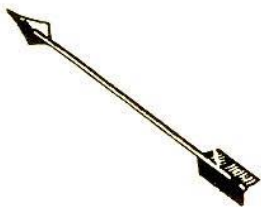
Pl.-II, Fig. 2