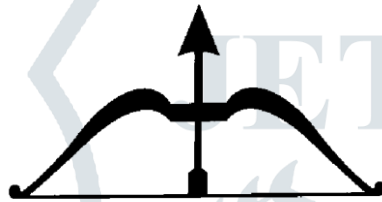
Pl.-II, Fig. 5