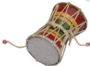
Pl.-III, Fig. 12