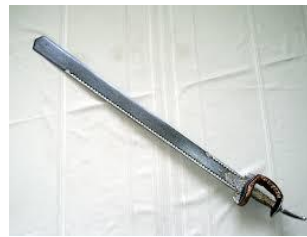
Pl.-I, Fig. 9