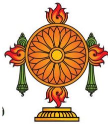
Pl.-I, Fig. 4