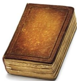
Pl.-IV, Fig. 9