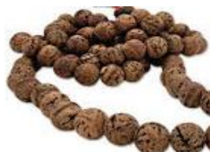
Pl.-IV, Fig. 10