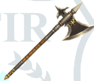
Pl.-II, Fig. 6