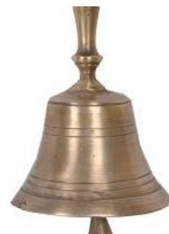
Pl.-IV, Fig. 1