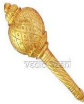
Pl.-I, Fig. 6