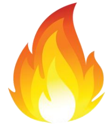
Pl.-II, Fig. 12