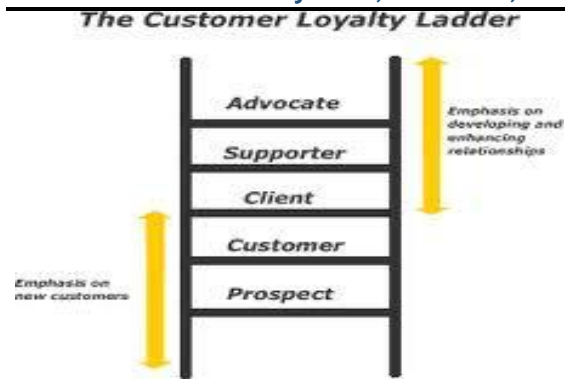
Figure no. 3

Loyalty is demonstrated by the actions of the customer. But it doesn't mean that the customer satisfaction level can measure his loyalty. Customer loyalty is not customer satisfaction. Customer satisfaction is the basic entry point for a good business to start with. A customer can be very satisfied with the deal and still not be loyal. On the other hand a customer may not express satisfaction but wants to remain loyal to the supplier due to some reasons which keeps him benefited from that supplier. For the same degree of satisfaction, the loyalty level may also be different for different suppliers.