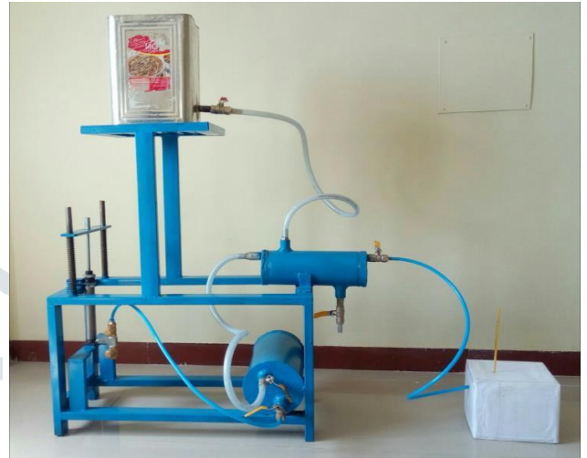
Fig-6: Air cooling system through vehicle suspension

used for exchanging heat from one medium to another working medium. The heat exchanger used is tube and tube type. The air is supplied inside tube and cooling liquid (water) is supplied outside of tube for producing cooling effect. This cooling liquid is store in air tank which is shown in figure. And supply the cooling liquid in inlet port of heat exchanger which is located at the top side of the heat exchanger. Then used water is drain from outlet port which is located at the bottom side of the heat exchanger.