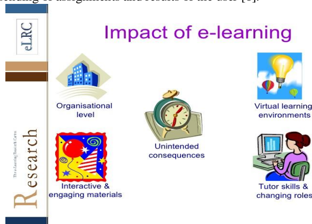
Figure 2: Impact of e-learning.

be full free on asking doubts online. Admin has full rights to accept or reject the activities that may be user registration, login uploading the lectures, managing the questions or sending of assignments and results of the user [6].