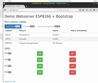
Fig 3: Demo

Arduino is an open-source electronics stage based on user-friendly hardware and software. Arduino boards are able to read inputs - Light on an antenna, a finger on a button, or a Twitter message - and turn it into an output - activate a motor, turn on an LED, publishing something online. You can advise your board what to do by sending a set of instructions to the microcontroller on the board. To do so you exploit the Arduino programming language (based on Wiring), and the Arduino Software (IDE), based on Processing. The ESP 232 is connected to the local router, to control these devices the ESP 232 should get dumped into the internet. This is done by designing a web server by dumping the ESP 232 into it. Webserver is designed in such a way that these home appliances are controlled.