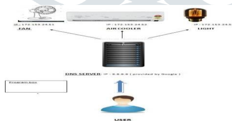
Fig: 1:-ESP232 WI-FI module

In this design firstly, we have to connect the home appliances with the internet protocol address which was generated by the ESP232 Wi- Fi module and the Wi-Fi module is being connected to the cloud with respect to the server which was developed by the user, these server gives the instructions to the specific IP address to perform any operation (on/off) which was given by the user and these instructions are being provided by the Arduino which program was dumped into it.