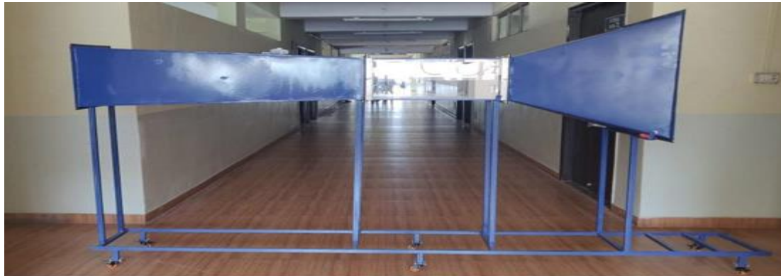
Fig.3: Actual Setup

The wind tunnel having close tubular passage with an object placed in the middle of test section for visual inspection. The diffuser section which consists of powerful fan system with one or multiple fans moves air past the object. Generally, wind tunnels comprised of a convergent section, a test section having honeycomb structure, a diffuser section with exhaust fan.