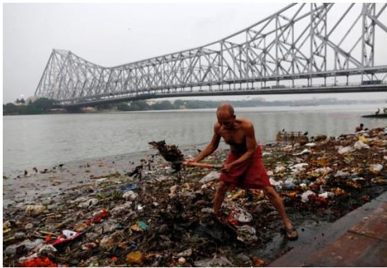
Fig1. India's Ganga river pollution

food have to suffer due to spreading of diseases from aquatic life. Certain items from this waste are non-biodegradable, radioactive, highly toxic, corrosive which affects the turbidity of the water.