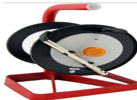
Fig. 2 showing GPS instrument, and Water level indicator instrument