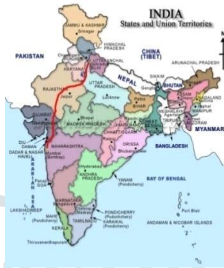
Fig. 1 Study area with Bore well point

In the present study, the area is in the part of Bilagi taluk and Bagalkot taluk in Bagalkot district, Karnataka state, India. It is situated 20 km apart from the west of Bagalkot. The area falls in Survey of India toposheets 47 P/11, 47 P/11. It is bound between 16°0' to 16°30' North latitude and 75°15' to 76°30' East longitude