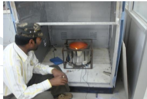
Figure 6: Burning of Rice husk Briquettes in Improved Cook-stove

The ash produced from burning of rice husk briquettes and the rice husk ash samples collected from mills were then used for Silica Gel Extraction. The department lab was used for extraction using the following chemical method. Freshly prepared 60 ml of 1N NaOH and 10 gm of ash were mixed to form a solution. This solution was then refluxed for 1 hour, cooled and filtered. 1 N HCl was then added drop-wise to this solution with constant stirring. This makes the Silica Gel precipitates out. The precipitate was then collected and washed thoroughly with distill water 5-6 times and then the gel was dried in Hot Air Oven for 12 hours at 120 0 C. Thus, Silica Gel was extracted from Rice Husk Ash. Flow chart of the method adopted is shown as follow: