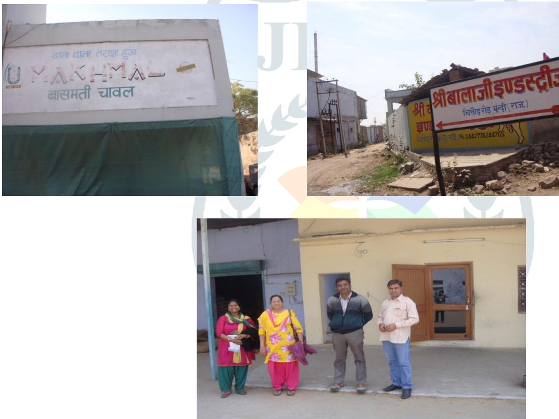
Figure 1: Rice mill visited at Bundi

A survey was done to find out the availability of rice mill in different districts of Rajasthan. During the study it was found that Rice husk mills are mostly situated at Bundi district in Rajasthan. Rice Husk mills that were visited at Bundi are; Makhmal Basmati Rice Mill, Tansen Balaji Industries, Jyoti Industries. These mills produce 20-25 tonns of rice husk daily and this rice husk is burned in the boiler of the mill itself. Remaining rice husk and rice husk ash are being sold at very low cost. These mills are using 70 percent of the total Rice Husk as a fuel in boiler and after burning the husk, 90 percent of ash is available to them. Remaining 30 percent Rice Husk and Rice Husk Ash are sold in Rs.300/qt to potter, Bricks manufacturing factory / industry and poultry farm. According to Makhmal Basmati Rice Industry Rice Husk Ash is sold to Glass Industry in Gujarat in Rs. 1300/per Trolley.