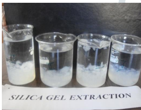
Figure 7: Precipitated Silica Gel