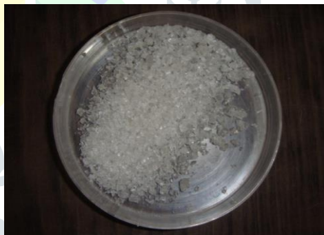
Figure 8: Dried Silica Gel