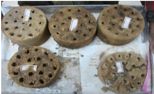
Figure 5: Rice husk Briquettes

husk was burnt in muffle furnace, traditional chullah and improved cook-stoves at the department for producing rice husk ash but the combustion was not proper because the residue was not complete ash. Therefore, briquettes of rice husk were prepared and then they were burnt in improved cook-stoves at the department for rice husk ash production.