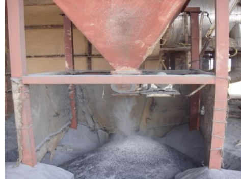
Figure 2: Rice husk after separation of rice Figure 3: Burning of rice husk in boiler of the mill