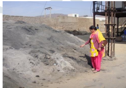
Figure 4: Disposed Rice Husk Ash in the premises of Mill