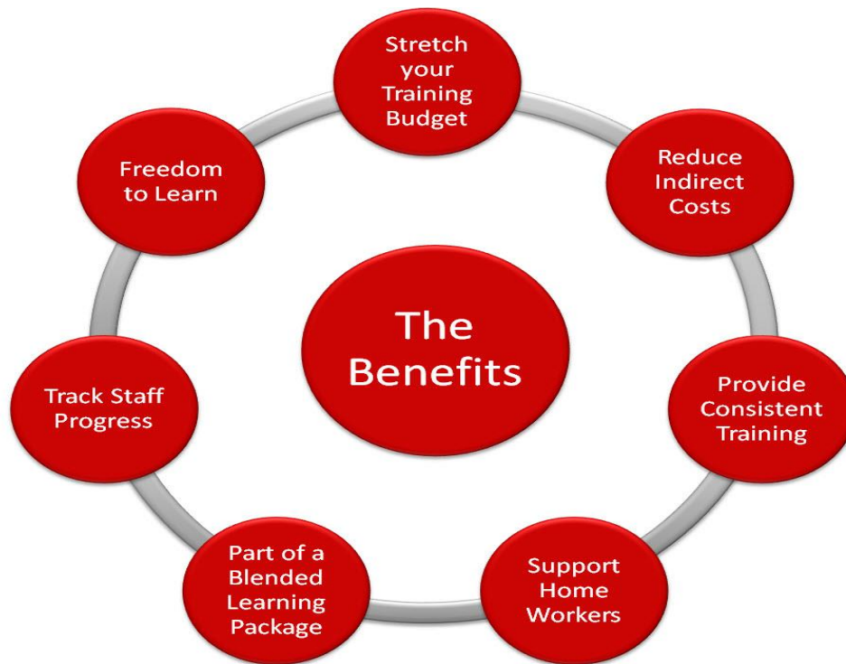
Figure 3: Benefits Of Data Mining In E-Learning

Coordinated Web Usage Mining: Contrasting to disconnect web use mining, consolidated web utilization mining is the methodology of deciding examples joined with e-Learning application. This spreads versatile sites, personalization of activities. Additionally, recommendation of activities to students as indicated by their top picks alongside their history of activities is finished via programmed recommenders in joined web utilization mining. A recommender-based affiliation rule mining is being extended at present that comprises of actualities of discovering material relationship between learning executions and making affiliation rules are prescribed to the student as the proposed subsequent stage in the learning session [10]. In this way, consolidated web utilization mining is a non-parametric methodology.