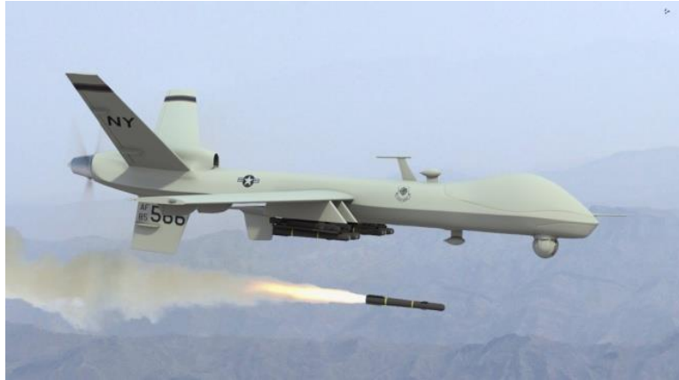
Figure 2 Armed drone.

The establishment of drone was started with its use in defense. It is the most significant sector where drones are used. Drones are being used in the military purpose from a long time. Armed drones came into use since 2000 (In figure2).