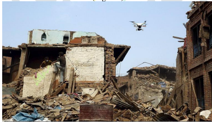
Figure 3 Drones used in disaster management.

As discussed, drones can be equipped with high vision cameras which can provide aerial views of disaster affected areas where human being can't reach physically. It can be used to locate trapped victims. We have seen cases of disasters like earthquake many people die because they can't be located. In these conditions drone can be very useful [1]. Victims can be located easily and can be saved. It can also be used to provide aid to victims. In cases of flood, it is very difficult for rescue team to reach victims immediately. In these conditions, drone act as a boon. It can immediately provide aid and other necessary things to victims. It can also be used for surveillance of affected area (Figure3).