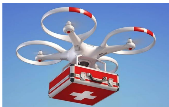
Figure 9 Drones used for medical purposes.

With the increase in vital diseases and emergencies, the rapid delivery of medi kits, aids, medicines, etc. are needed. Drones can help patient to provide efficient healthcare from distance as well in a short span of time. F(ig.9)