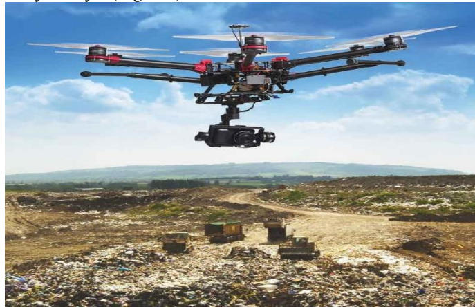
Figure 7 Drones used for waste management.

The management for the waste materials or garbage is very important for any country around the world. By having a proper waste management system, a place can be kept neat and clean. It can also prevent from having several diseases and the people around can have a proper and healthy lifestyle (Figure7).