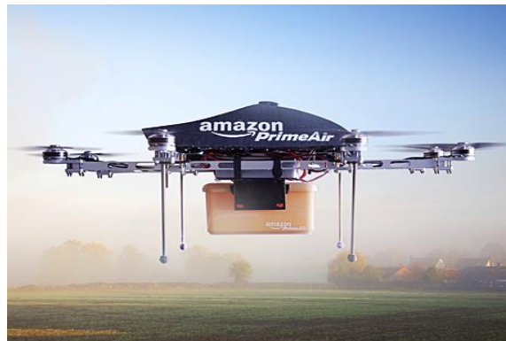
Figure 10 Drones used by amazon.

Drones have a wide range. They are also being used in in the shipping and delivery purposes. Many of the major companies in the world has started a new method for the delivery of their products. Sometimes it is a very difficult task for many companies for the proper shipment of the products being ordered by customers. For this purpose of shipping and delivery of the products they using the drones (Figure10)