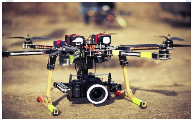
Figure 5 Drones for aerial photography.

The drones are used in a number of ways. It has a vast range in the marketing section. Drones are frequently used in the purpose of aerial photography. In the previous time, different cranes and helicopters were used for the purpose of aerial photography which were very expensive and not all the peoples were able to afford that. So, now drones are being used for this purpose (figure5).