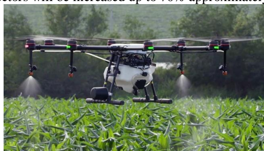
Figure 6 Drones used in agriculture.

Production of rich agriculture is actually the base of many countries in the world around. So, it is a must to keep an eye on its health for the better production of crops. Drones can be used in the purpose of agriculture and can be very efficient. In this sector, drone can be used easily in different ways. By the help of drone, data of a field can be gathered very easily by the farmers. It is very helpful for the maximization of efficiency of crops in the field. A farmer can easily detect the problems coming in the field by using the drone. In the drones infrared sensors are tuned by which the deficiency in the crops can be found out. Spraying of medicines through which the insects present are killed in the field areas can be done by using drones. The planting of seeds in the field areas is of the difficult tasks for the farmers. Through the help of drone, distribution of seeds in the field areas can be done very quickly and without any occurrence of problems. It can also be used for the pollination of flowers. In the upcoming years, the uses of drone in agriculture sectors will be increased up to 70% approximately (Figure6).