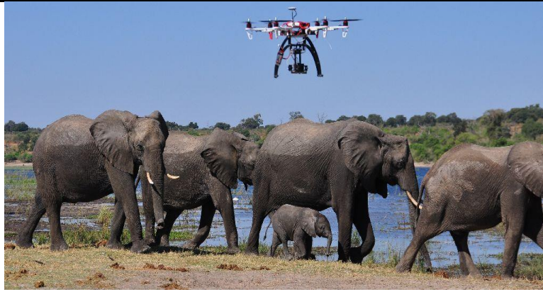
Figure 4 Drone used for surveillance of wildlife.

Then after drones were introduced in conservation of endangered species. They operate at around half of the cost of helicopter. It was very easy to use in comparison with helicopters. Six species of sea turtles were considered as endangered species and they were tended to found in open oceans. South University of Alabama are using drones to identify and locate green sea turtles and they have found positive result by using drones. Hence, positive outcomes were founded by taking drones in use for the conservation of endangered species.