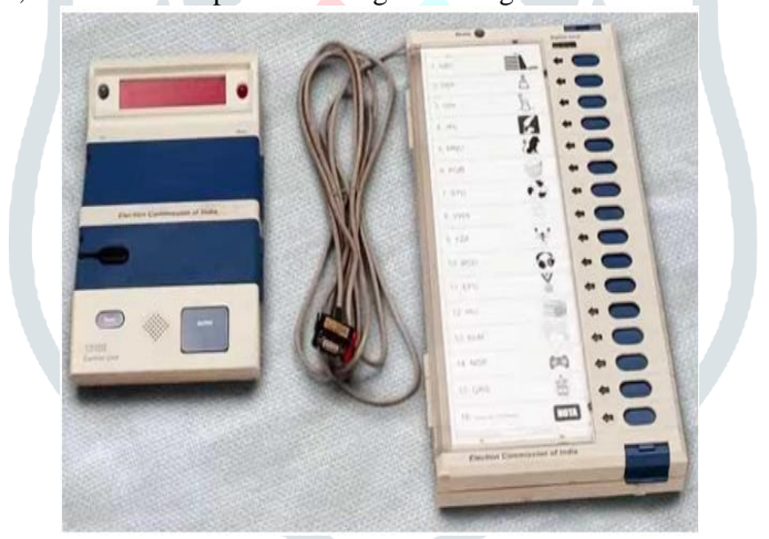
Fig1: Electronic voting machine

Electronic Voting Machine (EVM) is a simple electronic device used to record votes in place of ballot papers and boxes which were used earlier in conventional voting system. Fundamental right to vote or simply voting in elections forms the basis of democracy. All earlier elections be it state elections or centre elections a voter used to cast his/her favorite candidate by putting the stamp against his/her name and then folding the ballot paper as per a prescribed method before putting it in the Ballot Box. This is a long, time-consuming process and very much prone to errors. This situation continued till election scene was completely changed by electronic voting machine. No more ballot paper, ballot boxes, stamping, etc. all this condensed into a simple box called ballot unit of the electronic voting machine. Because biometric identifiers cannot be easily misplaced, forged, or shared, they are considered more reliable for person recognition than traditional token or knowledge based methods. So the Electronic voting system has to be improved based on the current technologies viz., biometric system. This article discusses complete review about voting devices, Issues and comparison among the voting methods and biometric EVM.