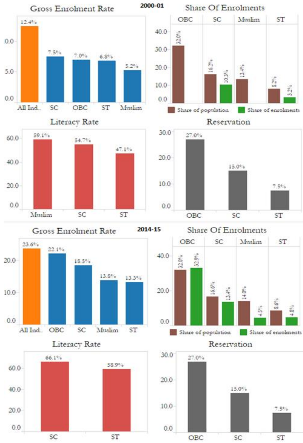
CHART 1: RESERVATION IN HIGHER EDUCATION: THE BIG NUMBERS