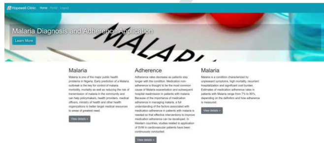
Figure: Doctor Portal