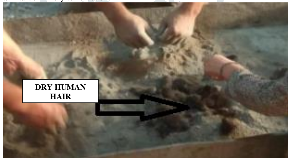
Fig 2: Human hairs were mixed in dry cement

The mixing of hair was done in dry cement as shown