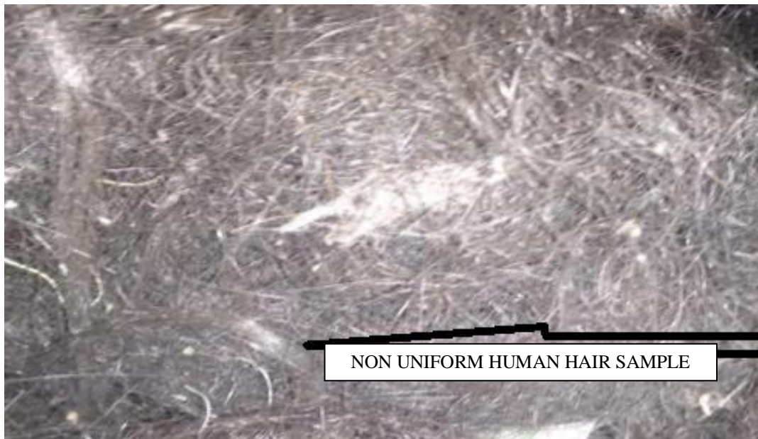
Fig. 1: Showing Human Hairs

The mixing of hair was done in dry cement as shown