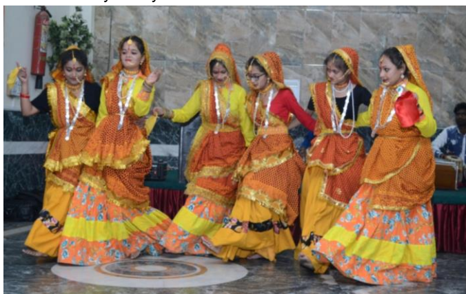
Dance in Traditional Costumes

In performing ceremonies and other rituals Rangwali Pichhora is commonly used. This Rangwali Pichhora, the tradition of colourful ornamentation on Anchal cloth is a unique symbol of Kumaon. Women wear the cloth Rangwali Pichhora or Kusumia during all the rituals and ceremonies. The Rangwali Pichhora is about three meters in length and one to one and half meter width white muslin cloth dyed in yellow colour and dried in the shade.