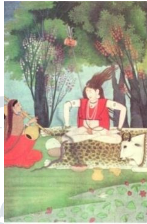
Miniature Painting of Garhwal School- Lady with Shiva