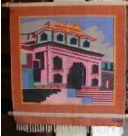
Wall Hanging of Badrinath

Bhotia women are good weavers of carpet, blankets and woollen clothes etc. Purdah was common among Bhotia women. However they do not observe Purdah at present and mix up freely. The Ranpa women of Nitimana practice Purdah. House wives in tribes not only work hard at home throughout the day but also work in the fields and looms. They are experts in arts and crafts and contribute towards the family economy through their creations; carpets, woollen clothes and other utility items.