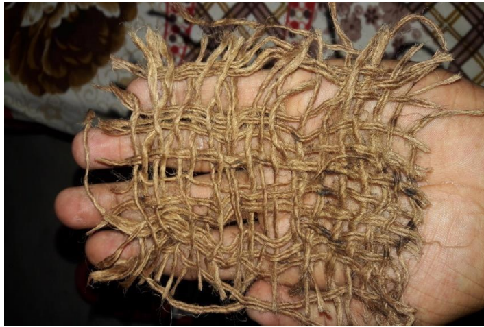
Figure 2: Modified jute fiber