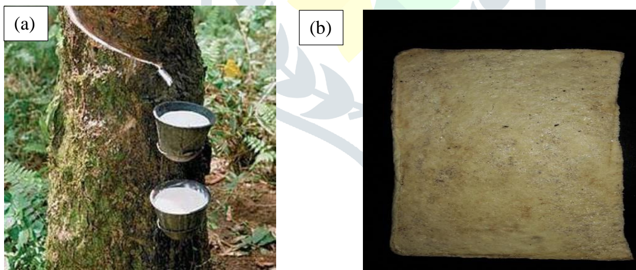
Figure 1: (a) Natural Rubber and (b) Vulcanized Rubber

Vulcanization –Significantly in the wake of playing out every one of these means the rubber isn't a lot stiffer and tougher so that it can be utilized in different things alike vehicle tires and hardware. To upgrade every one of these properties, sulfur is added to the rubber and then heated up to a temperature covering 373 k to 415 k. This procedure is acknowledged as vulcanization.