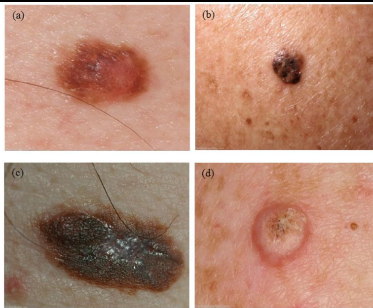
Figure 2 Four examples of skin lesions: (a) dysplastic nevus, (b) seborrheic keratosis, (c) melanoma, and (d) squamous cell carcinoma (images publicly available in [3])