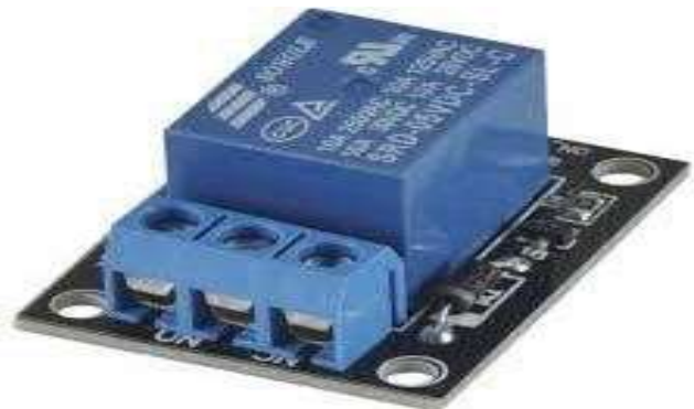
Fig 5. DC relay

The relay is an electromagnetic device. It is used to separate two circuits electrically and connect them magnetically. Relays are very useful and makes it possible that one circuit can switch the other while both are not linked to each other. Relays are used mostly to combine an electronic circuit to an electrical circuit so that the electric circuit works at very high voltage. There are three contactors in basic relay: normally open (NO), normally close (NC) and common (COM). When there is no input state, the COM is connected to NC. When the operating voltage is applied to relay, the relay coil gets charged and energized and COM changes to NO contact. A relay runs by an electric current which is small and can turn on or off a much larger electric current. The core of a relay is an electromagnet.