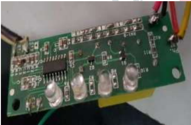
Fig 2. Current Sensor

A current sensor is a device that detects electric current (AC or DC) in a wire, and generates the pulses with fixed interval of time.