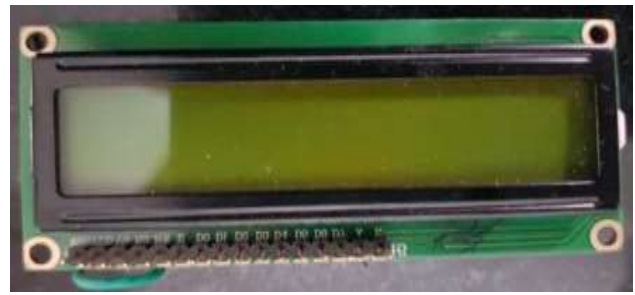
Fig 3. Liquid Crystal Display

LCD Display is mainly used to display characters. It contains two rows each of which contains 16 bits. Hence totally two rows each of 16bits can be displayed. BIT 1 is ground, bits 7- 14 are the data bits, bit 15 is the back light anode and bit 16 is the back-light cathode. Bit3 is mainly used provide input voltage for LCD.