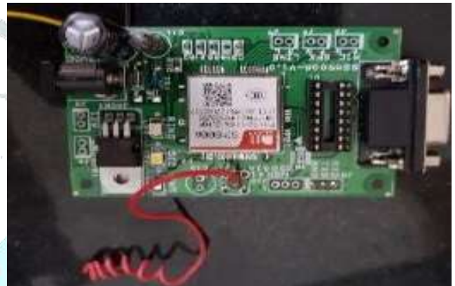
Fig 4. Global Service for Mobile

GSM mainly acts as an intermediate between the microcontroller and the user. The commands which come from other sensors are passed on to the GSM first and then GSM passes it to the microcontroller.