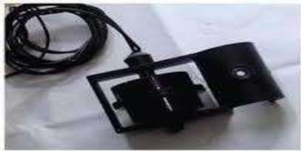
Fig 7. Oil Float Sensor

An oil float sensor is a device used to detect the level of liquid within a transformer.