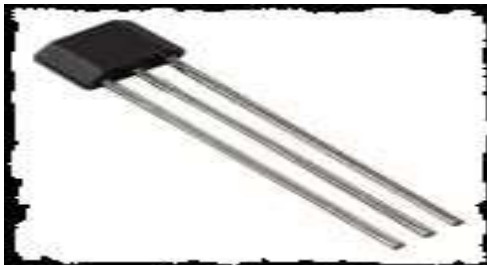
Fig 6. Temperature Sensor

Temperature sensor is mainly used to detect the temperature or heat. LM35 is used as the temperature sensor.