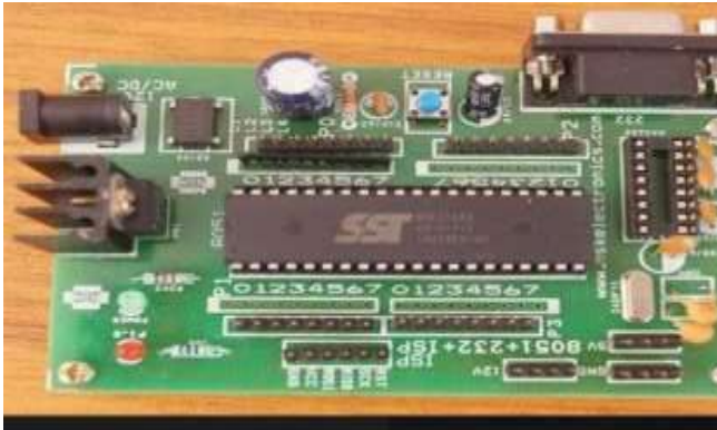
Fig 1. Microcontroller

The SST89E516RD is a 8-bit microcontroller product manufactured by CMOS semiconductor technology. It offers significant cost and reliability for customers by using split gate cell design and thick-oxide tunneling injector. The instruction set used is 8051 and it has more random access memory and read only memory capacity. It also has 3 timers.