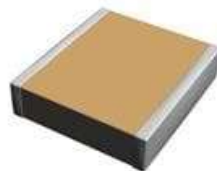
Figure 1. Multilayer Ceramic Capacitor

As now-a-days, an integrated chip is comprised of thousands of electronic components, whose performance is integrated to all components. So, failure of one component can initiate the complete failure of the whole system or device. A capacitor is a passive electronic component, which has extensive range of use in various spectrum of life(Longland, Hunt, and Brecknell 1984). The multilayer ceramic capacitors also known as MLCC, are the type of capacitors in which small value capacitance is required. It is surface mounted device type capacitor, which is widely used in industrial applications. The main application of multilayer capacitor is in operational amplifier and as bypass capacitor(Takahashi and Kozawa 1980). The performance of capacitor is depending on the amount of electrical charge it can store. The advantages of MLCC are better frequency characteristics as well as more power to withstand the voltage (Caswell 2013).