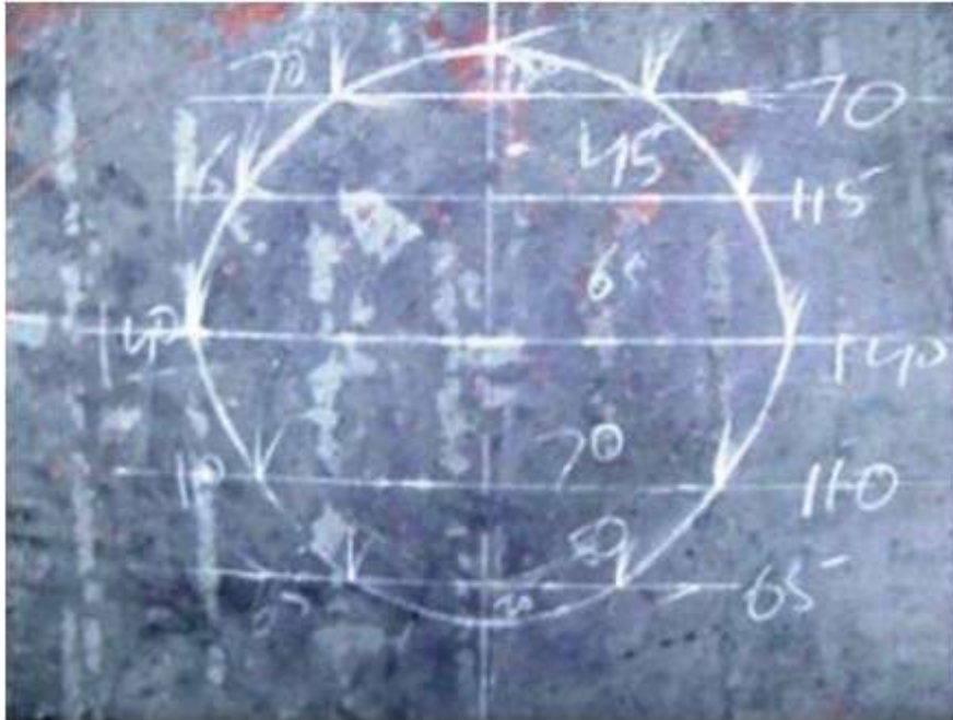
Fig. 2 Marking on the casing surface

It is found through analysis that different workers take different time in the marking activity. And the variation of time taken between different workers is significant. The marking activity is studied further in detail and it is observed that this activity is completely manual and depends upon the skill of the worker. In this activity, the worker has to develop a marking on the surface of the casing as shown in figure 2.