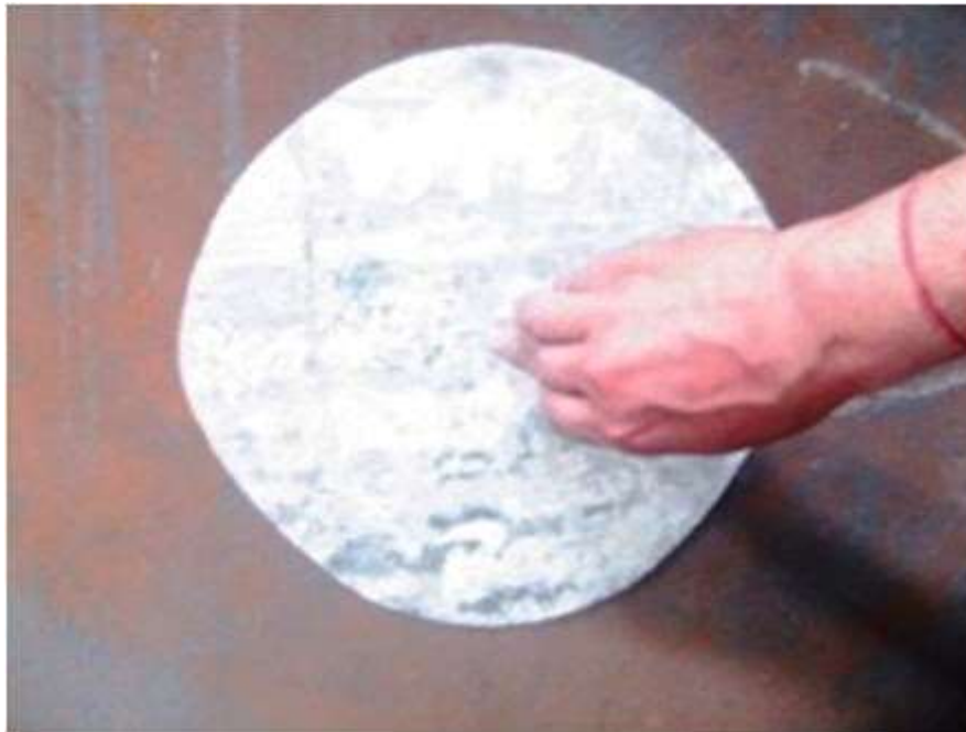
Fig. 4 Marking template

This standard template has changed the marking process. The worker has to just place the template on the marked center of the casing and make an outline of the template on the surface of the casing to develop the required marking. The process is documented in the form of standard instructions and training has been provided to the concerned personnel regarding the use of the template. This newly developed standardized work process has resulted in the saving of 50 min in the total cycle time of the casing manufacturing process.