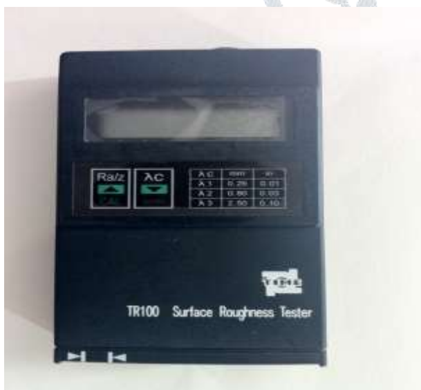
Fig.2 TR100 Surface roughness tester

Roughness of machined samples of various alloys under different conditions was evaluated using Ra surface roughness. Average value of properties was taken for study. The roughness of the alloys was evaluated using roughness tester (TR100 Surface roughness tester, made by TIME High Technology Ltd., Beijing) as shown in figure 2, under the following conditions: Standard: ISO 1999, Traversed length: 6mm, Cut-off length: 0.8mm, Radius of the Stylus: 10.0 \pm 2.5\mu\text{m} , Speed: 0.25mm/s