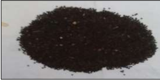
Figure- 1.3: Argemone Mexicana seeds