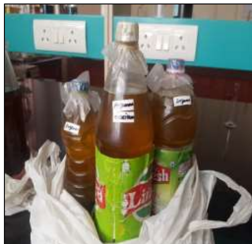
Figure- 1.8: Argemone oil