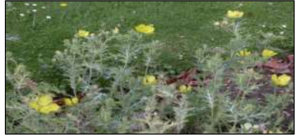
Figure- 1.4: Argemone plant