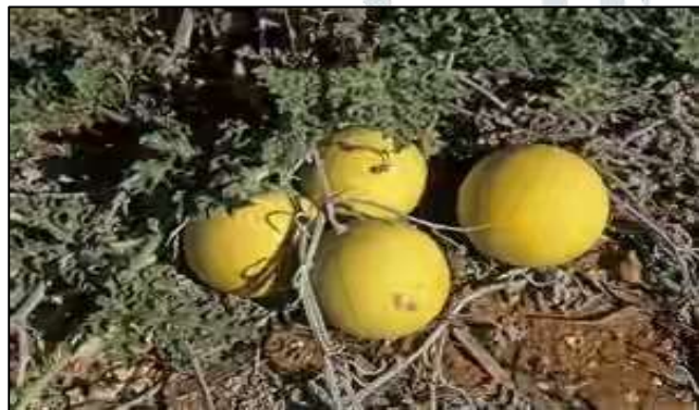
Figure 1.1: Thumba plant with fruit