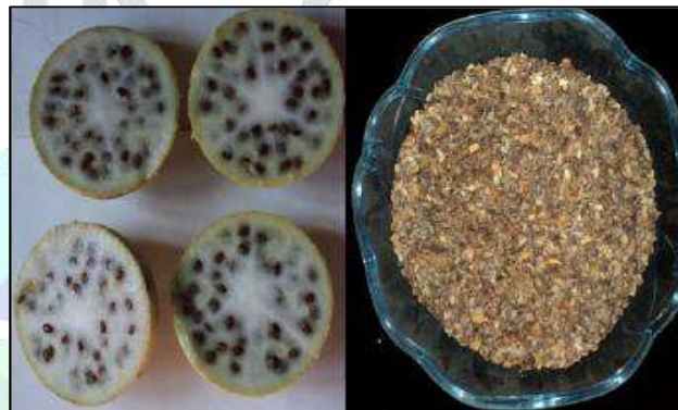
Figure- 1.2: Thumba seeds