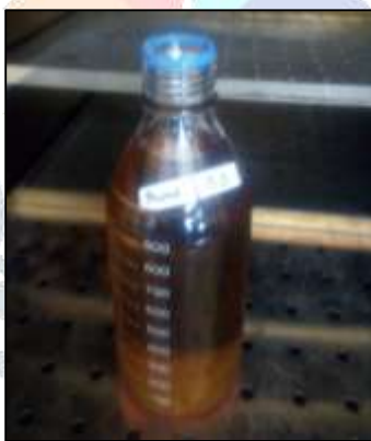
Figure 1.11: Thumba biodiesel (B100)

Finally, after heating at 100-105 0 C in a hot air oven the pure Thumba biodiesel is shown in figure-11 below: