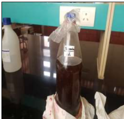
Figure-1.7: Thumba oil