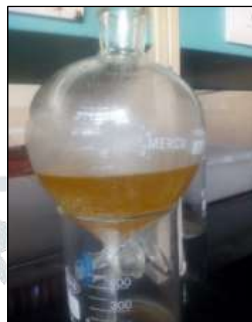
Figure 1.10: Separation process

Finally, after heating at 100-105 0 C in a hot air oven the pure Thumba biodiesel is shown in figure-11 below: