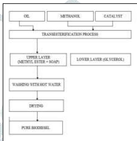
Figure-1.6: Biodiesel production flow chart

Below is a flowchart which clearly indicates that what are the processes used in transesterification in yielding of biodiesel from raw vegetable oils