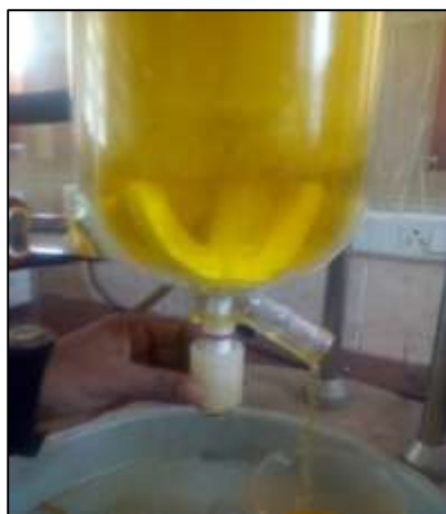
Figure- 1.9: Washing with water

Before starting transesterification process for Thumba oil, the Fatty acid value measured was 4.4 MgKOH/gram of sample, which concludes one-step transesterification can be used. After that, 1500ml of oil was poured into the reactor and heated @ 65 0 C by means of hot water circulation. As the oil attained some temperature, dissolved solution of 390ml of methanol and 10gram of KOH was poured into the oil for removing glycerol, soap etc from raw Thumba oil. The reactor was continuously stirred for about 2 hours and then the whole mixture is poured with water 5-10 times to eliminate impurities like soap, glycerol etc as shown in below figure-9. After proper washing, the mixture was allowed to settle in a separating funnel as shown in figure-10 below for two days so that any heavy matter will settle at the bottom to be removed.