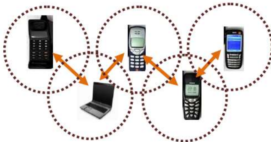
Figure 5 MANET Structure

Over a past year there is excessive increase in popularity of Mobile Devices and wireless network and due to this MANET has become a vibrant and active field of communication. Interconnected mobile network is another term that is frequently used for MANET. For research and development of wireless network it's a promising field[2].