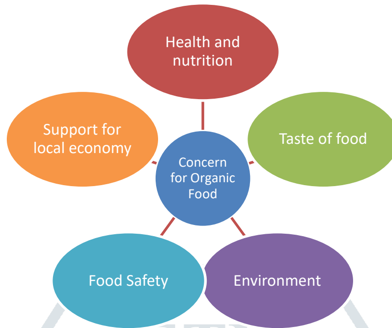
Fig. 2 The Major Concern Of The Organic Food

Research has also focused on the identification of the everyday organic food customer's more complex, psychographic profile. "It results from an ideology linked to a particular value process that controls temperament, attitudes and consumer behaviour measurements." The ideals of altruism (friendship with others), ecology (harmony with the environment and a cohesive society), communism (protection of the well-being of all people and nature) [10], benevolence (improving the well-being of people with which one is in regular personal interaction), spirituality (inner harmony and solidarity with nature) and self-direction (independent thinking and action) have been connected to the people. The figure 2 has been showing the major concern of the organic food.