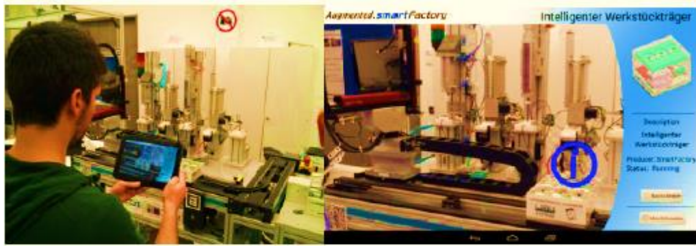
Fig. 2: The Augmented smart Factory-App as an example for real-time Information supplying with Augmented Reality

The pre-processed and aggregated knowledge would be immediately available by the industrial stakeholders involved in the assistance networks, which will enable a variety of specific implementation scenarios. Including: operation (meaning maintenance) of manufacturing plants through delivering immersive, virtual guidance Production process management as well as quality assurance by context-sensitive collection and distribution of knowledge such as the state of CPS preparation and (co-)simulation of manufacturing processes, e.g. through visualizing the actions of CPSs (such as products flow material).