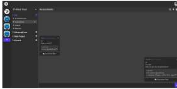
Fig 3 Fortran Chatspace with translated messages

Database. In parallel, the server will emit a broadcast signal to the other members of the community, with the message data. Other members of the Community will receive the message on listening to the broadcast signal which the server emits. On receiving the message, the client will call the Google Translation API through the node.js server with the message data and their preferred language. The Google Translation API then translates the message and sends it back to the server. The server then sends the translated data back to the user.