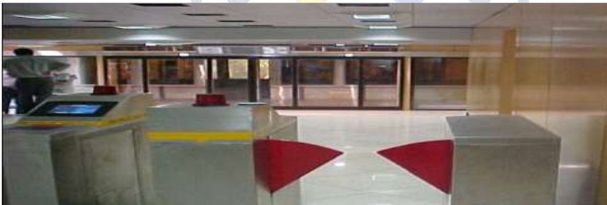
Fig no. 7. Sky stations