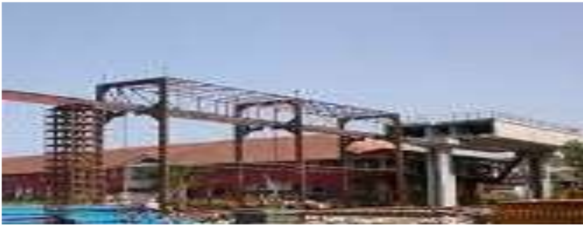
Fig.no.8. Transverse Arrangement