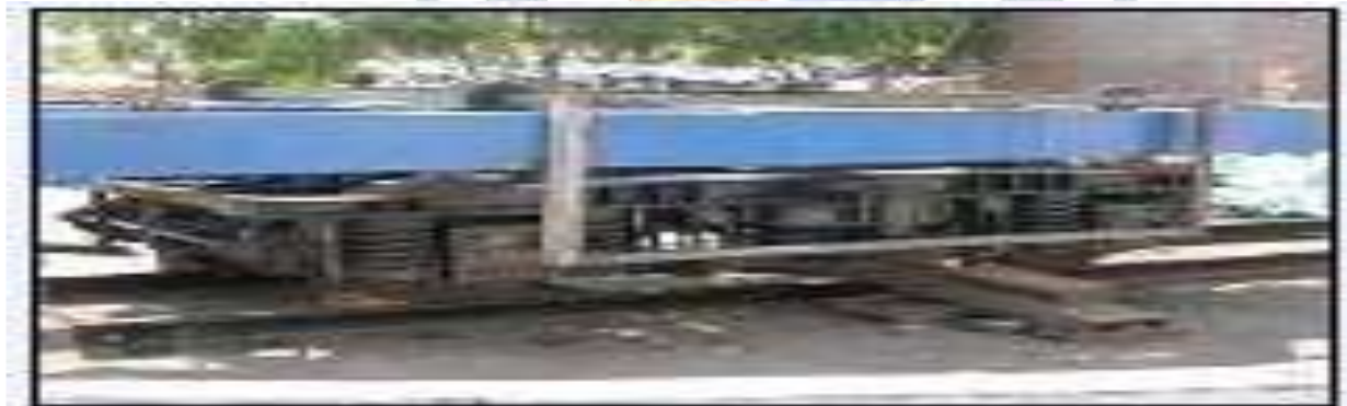
Fig no.3. Arrangements of Bogies