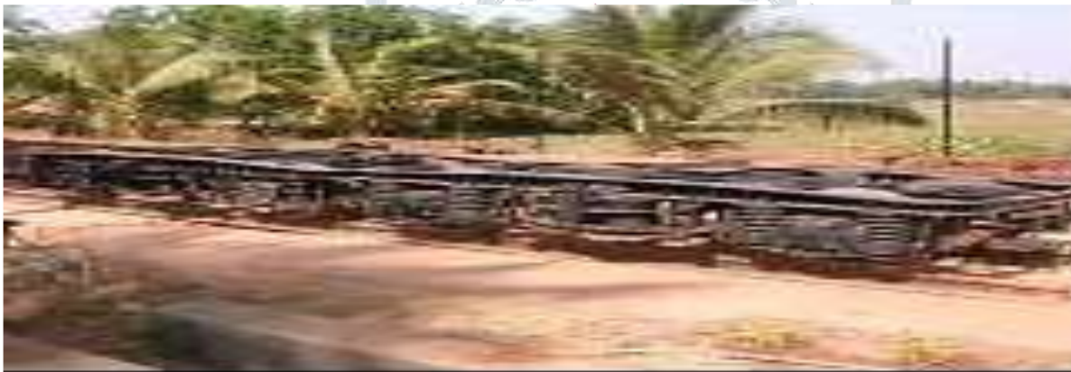
Fig no.5. Sky Bogie