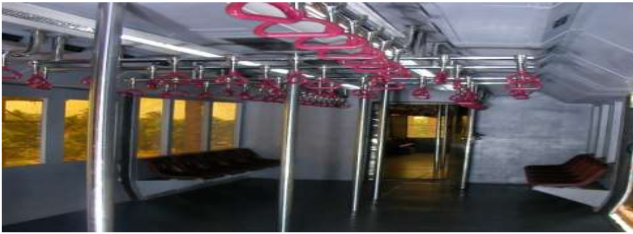
Fig no.6. Sky coaches