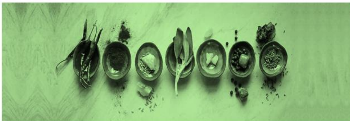
Figure 2: Some of the India spices and herbs that are considered in the Rasayana therapeutic treatment method [7].

This is one of the most famous concepts of Ayurveda. The Ayurvedic science and its pharmacology has classified the herbs or medicinal Indian plants into numerous different categories according to the reactions of the plants on different actions of the body. One of these categories, the Rasayana category is considered most suitable to treat the symptoms of aging. The literal meaning of the word 'Rasayana' is combined of two words 'Rasa' that stands for plasma and the Ayana that means path. Considering the beliefs of the Ayurveda, according to these beliefs the positive influences and qualities of the great 'Rasadhatu' improves the health and the response of other present Dhatus i.e. tissues in the body as well. Therefore any kind of medication which improves the value and quality of the Rasayana will be capable of strengthening or promoting the health and regeneration of all tissues present in the human body. The Rasayana medicine acts inside the human body by manipulating the combination of the biochemical of neuro, endocrine gland and the immune system of the body. These Ayurvedic Rasayana are rich sources of the anti-inflammatory and antioxidant chemicals.