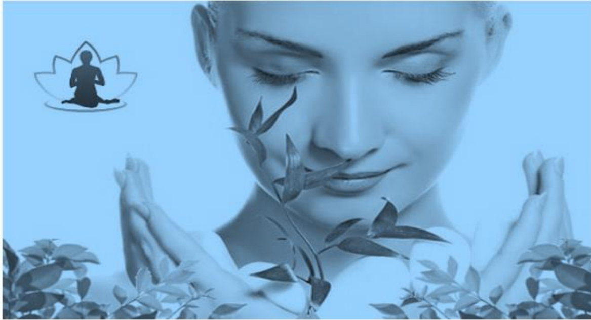
Figure 1: Shows the healing power of Ayurveda in the arresting of aging symptoms in the human body.

In Ayurveda Rasayana or Rejuvenation therapy is one of the most special methods. Rasayana is basically a therapeutic process performed to achieve the high immunity promoters, increases the anti-degenerative which rejuvenates the complete health care and helps for the prevention of the symptoms of the Ageing. Hence one can say it has the capability to improve the quality of human life in the sense of both kinds of people being healthy and also for the ill individuals suffering some kind of health problem. Refer the Figure 1 for visual description of the concept [3]. Rasayana incorporates two words Rasa and the Ayana, where the rasa word refers to the Dhathu i.e. Tissues and Ayana refers to the marga i.e. movement. Hence, Rasayana basically nourishes the Rasadi Dhatus i.e. plasma. The Jara means Ageing is known as Vardhakya in Ayurveda. In Ayurveda the Kalajajara i.e. the mature Ageing is not considered for cure or say it is not curable, but still for graceful ageing the vitality in the cellular homeostasis can be maintained through the Rasayana and the practices of Kalajajara i.e. Premature Ageing that can be managed and controlled with the help of Rasayana as being defended by the Acharya's (Sages) in Ayurveda [4].