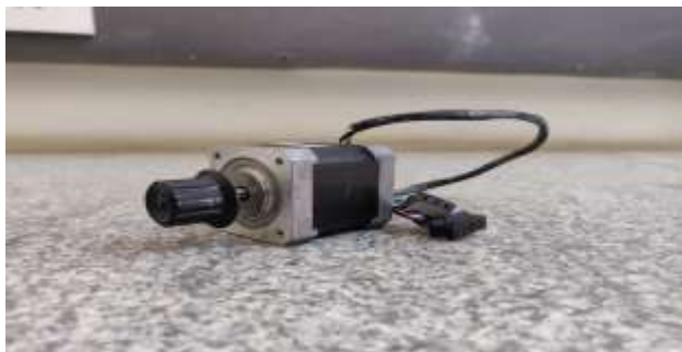
Fig. 6: Stepper motor

A stepper motor, also known as step motor or stepping motor, is a brushless DC electric motor that divides a full rotation into a number of equal steps. This helps to control the angular or linear position, velocity and acceleration. Stepper motor receives the signal from arduino which in turn helps the spindle to rotate. Due to the spindle rotation the fluid flows into the fluid line as shown in figure 6. Table 4 describes the specifications of IR sensor.