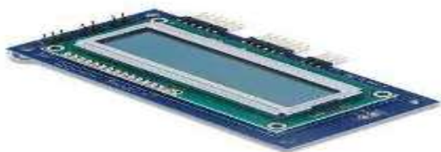
Fig. 7: LCD screen

Liquid crystal display is a display that provides information on the flow rate of Intravenous fluid per unit time. It is connected to Aurdino as shown in figure 7.