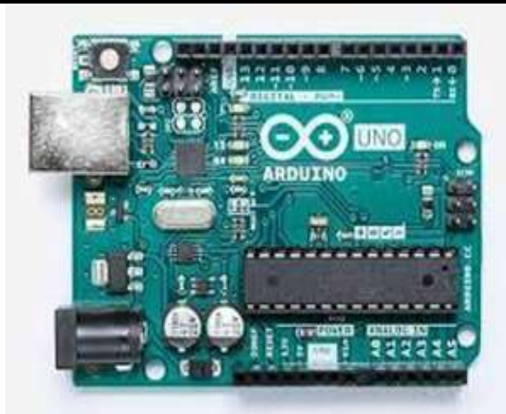
Fig 3: Arduino