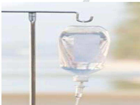
Fig. 4: Saline Bag

A saline bag is a bag that consists of solution (such as sodium chloride, ringer lactate etc) which is administered to patient's during intravenous infusion as shown in figure 4.