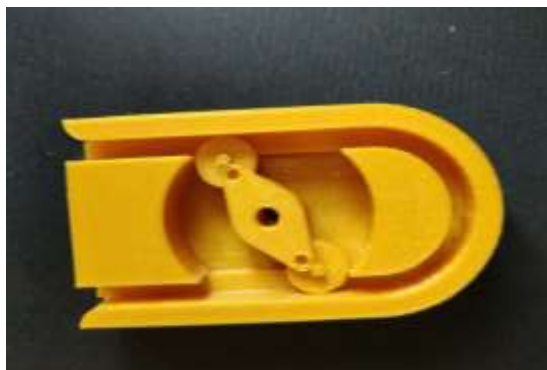
Fig. 5: Flow Regulator

Flow regulator is a device which controls flow of fluid inside the intravenous tube. It consist of blade which has a roller connected to it. With the help of stepper motor the roller rotates and controls the flow of the fluid with different velocity.