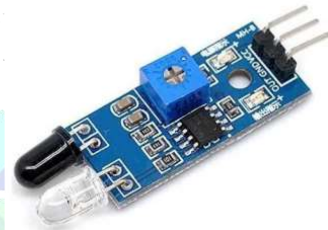
Fig. 5: IR sensor

An IR sensor can quantify the warmth of an item just as recognizes the motion. These kinds of sensors estimates just infrared radiation, as opposed to transmitting it that is called as a detached IR sensor as shown in figure 5.