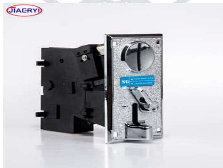
Fig 5.: Multi Coin Selector