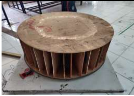
Fig 12.: Outer structure of book vending machine[20]