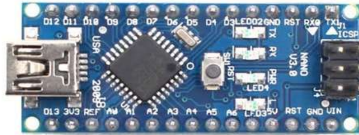
Fig 3:Arduino Nano

independently and eventually adapt them to their particular needs. The software, too, is open-source, and it is growing through the contributions of users worldwide.