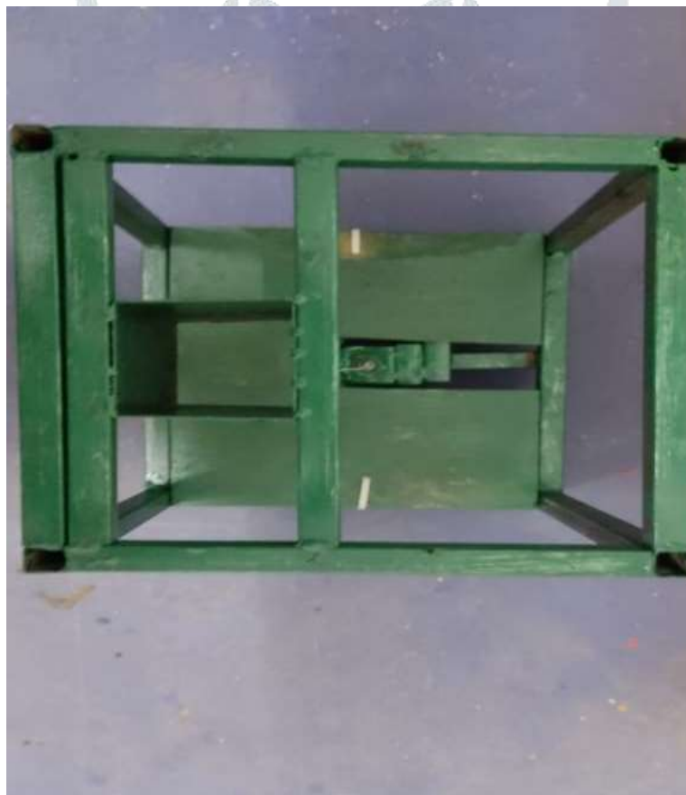
Fig 9.: Top view of the structure

Dimensions :- Height X Width X Thickness 38 X 30 X 30