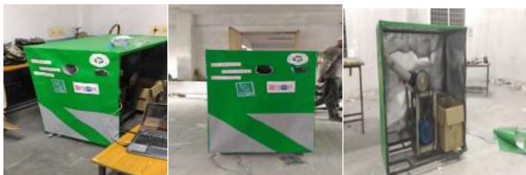
Fig 10.: Outer and inner structure of reverse vending machine[18]

The machine is easy and is extremely straightforward to control. In future the project can be extended with addition of few more variety of masks. The coin acts as the medium that completes the detection circuit. A 5V power supply is used to drive the microcontroller. The event of coin detection is morphed as an external interrupt to the microcontroller and is received at pin RB0 by the microcontroller. The microcontroller is programmed in such a way that this interrupt increments a counter which indicates the number of coins inserted by the user. But the maximum number of coins to be inserted has been limited to four (two-rupee coins)[18].