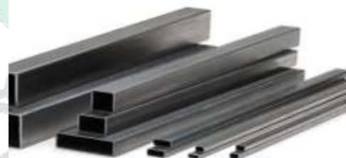
Fig 2: Hollow mild steel