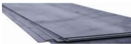
Fig 1: Mild steel sheets

Mild steel is a type of low carbon steel. Carbon steels are metals that contain a small percentage of carbon (roughly between 0.05% and 0.25%) which enhances the properties of pure iron.