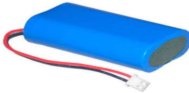
Fig 4.: Rechargeable Battery