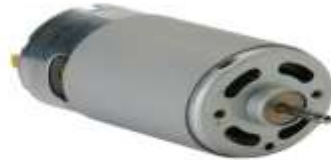
Fig 6.: 12V DC Motor