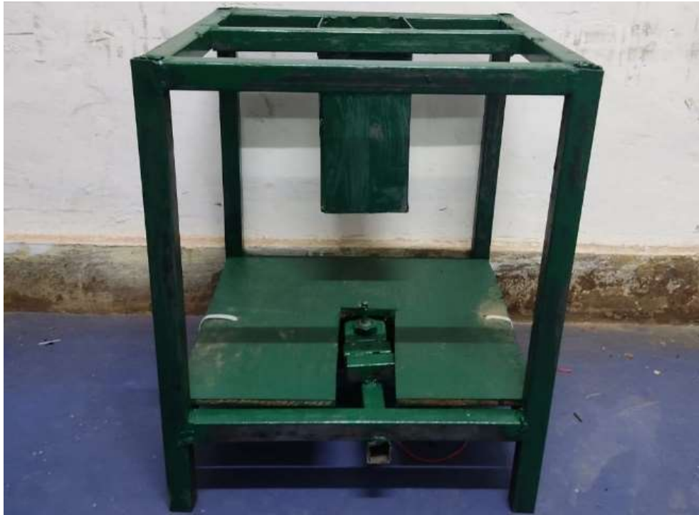
Fig 8.: Front view of the structure