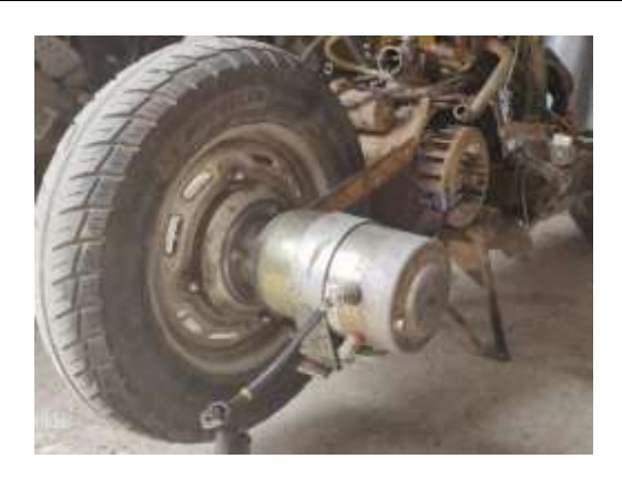
Fig.4 BLDC motor installation