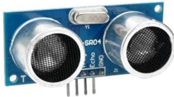
Figure 2: Ultrasonic Sensing Module

Ultrasonic Sensor: Ultrasonic sensor is a gadget that can gauge the separation by utilizing sound waves. It gauges the separation by conveying a sound wave at a particular recurrence which transducers have piezoelectric precious stones which reverberate to an ideal recurrence and convert electric force into acoustic force as shown in figure 2. A yield signal is created to play out a couple of kind of showing or control work.