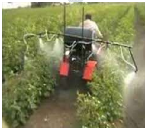
Figure 2: Lite-trac spraying

Lite-Trac is a trading name of Holme Farm Supplies Ltd, a manufacturer of agricultural machinery registered in England and based in Peterborough. The Lite-Trac name comes from "lite tractor", due to the patented chassis design enabling the inherently very heavy machines manufactured by the company to have a light footprint for minimum soil compaction. Holme Farm Supplies Ltd agricultural products, sold under the Lite-Trac name, include tool carriers, self-propelled lime and fertilizer spreaders, sprayers, granular applicators and tank masters. Lite-Trac is currently the manufacturer of Europe's largest four-wheeled self-propelled crop sprayers. The company's products are identifiable by the combination of unpainted stainless steel tanks and booms with bright yellow cabs and detailing. A Lite-Trac crop sprayer, or liquid fertilizer applicator, mounts onto the SS2400 Tool Carrier centrally between both axles to maintain equal weight distribution on all four wheels and a low centre of gravity whether empty or full. The stainless steel tanks are manufactured in capacities of up to 8,000 liters, whilst Pommier aluminium booms of up to 48 meters can be fitted, making these Europe's largest four-wheeled self-propelled sprayers.