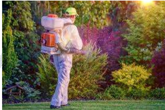
Figure 1: Backpack type spraying

Hydraulic sprayers consist of a tank, a pump, a lance (for single nozzles) or boom, and a nozzle (or multiple nozzles). Sprayers convert a pesticide formulation, often containing a mixture of water (or another liquid chemical carrier, such as fertilizer) and chemical, into droplets, which can be large rain-type drops or tiny almost-invisible particles. This conversion is accomplished by forcing the spray mixture through a spray nozzle under pressure. The size of droplets can be altered through the use of different nozzle sizes, or by altering the pressure under which it is forced, or a combination of both.