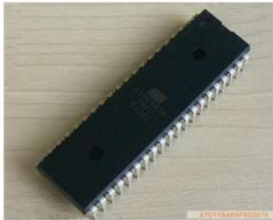
Fig. 4 AVR microcontroller.