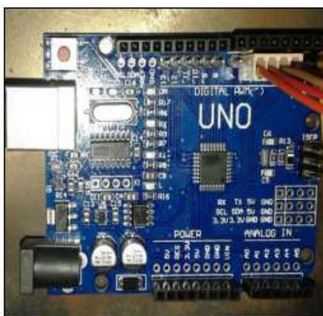
Fig. 2 Aurdino UNO