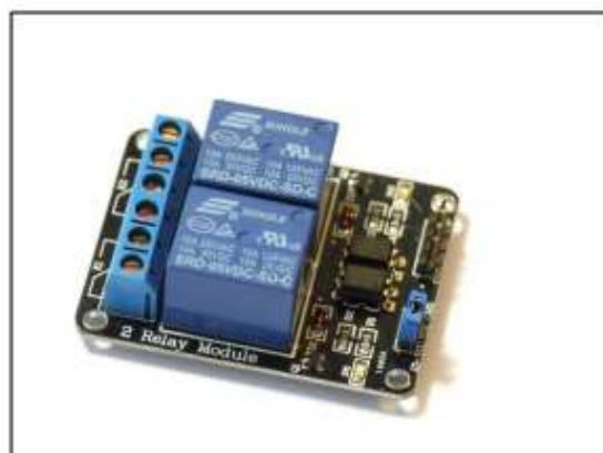
Fig. 3 Relay used in solar grass cutter.

In figure 3 shows are a relay is an electrically operated switch. Several relays use a magnet to automatically operate a switch, however alternative in operation principles are used, like solid state relays. Relays are used wherever it's necessary to regulate a circuit by a separate low-power signal, or wherever many circuits should be controlled by one signal. The essential relays were handling in long distance communicate circuits as amplifiers, they unbroken the signal coming back in from one circuit and re-transmitted it on another circuit.