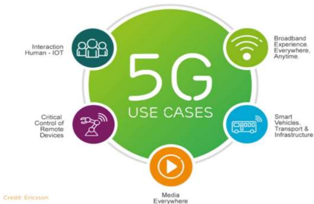
Figure 3: The above figure shows the future of 5G Technology [Xorlogics].