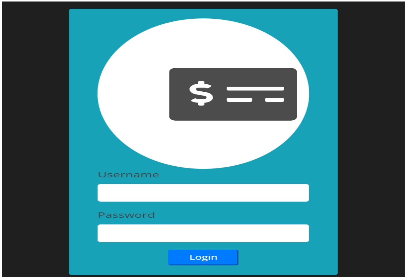
Fig.2 login window