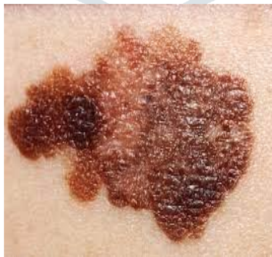
Figure 2 Picture clicked by smartphone of Melanoma infected skin

This is the process in which pictures of lesions are clicked by smartphones or digital cameras and processed in a system to detect that the person is suffering from Melanoma or non- Melanoma. It works on the algorithms and is detected automatically by combining lightweight methods. This method saves much more time than the other processes. In this process, the algorithm works in two parts – Wrapper and Filter. Wrapper evaluates all the goodness information. But the filter selects the required data and arranges it for giving full information about the image.