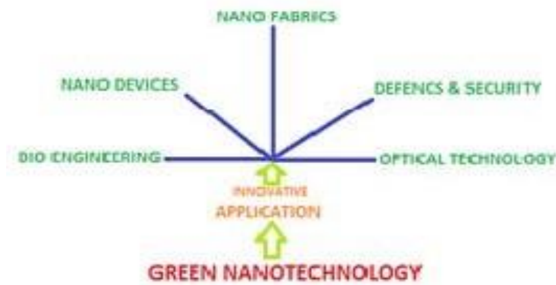
Figure 1. Application of nanotechnology