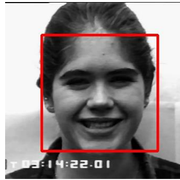
Fig. 4 Face Detected Image

After noise remove, next step to detect the actual face. So using cascade classifier, the face detection is done. The outcomes are displayed in the figure 4.