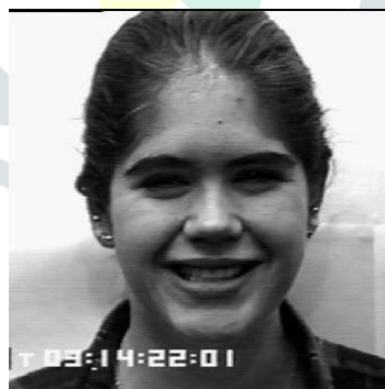
Fig. 2 Gray Image