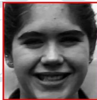
Fig. 5 Face Crop Image

After face detection, next step is to crop the detected face from image for feature extraction process. The outcomes are displayed in the figure 5.