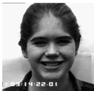
Fig. 3 Noise Removed Image