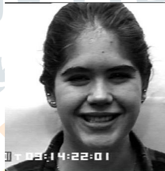
Fig. 1 Input Face Image

Let us consider the face image in figure 1. Gray scale conversion is completed which is shown in figure 2 and Median filtering is implemented on the acquired images to get rid of the unwanted noises. The outcomes are displayed in the figure 3 respectively.