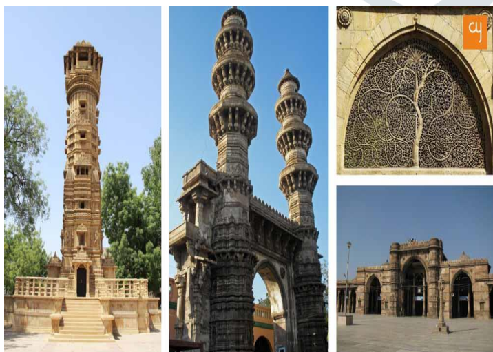
Fig. 2: National Heritage Sites – Jhulta Minara, Sidi Saiyad Jali, Choti Jami Masjid

In order to experience the glory of Ahmedabad, it is mandatory to walk through the walled city and to observe its rich and varied architecture, its religious places, art, culture and traditions. As a result, ‘The Heritage Walk’ was launched by Ahmedabad Municipal Corporation (AMC) to enable the tourists and citizens to unveil this aspect of the city. The walk starts at Swaminarayan Temple, Kalupur, with 20 pause points, covering a length of 2 km, lasting for over two and half hours.