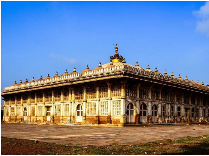
Fig. 4: Sarkhej Roza