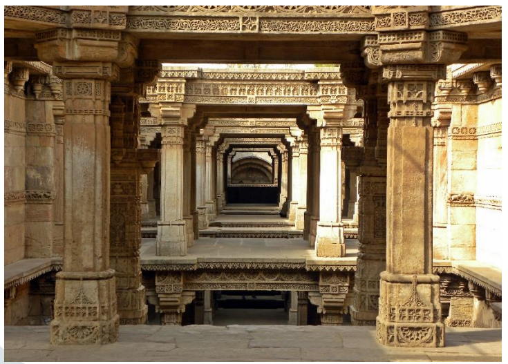
Fig. 5: Adalaj Step-Well