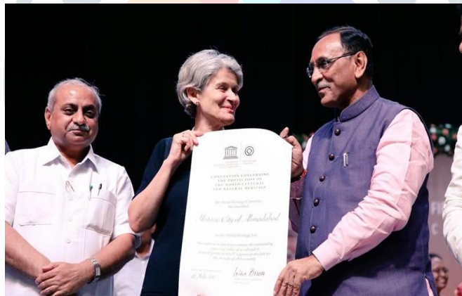
Fig. 6: UNESCO Director General Irina Bokova handing over the certificate declaring Ahmedabad as a ‘World Heritage City’ to Gujarat Chief Minister Mr. Vijay Rupani

I am proud to be a citizen of Ahmedabad, which has managed to bag the title of “World Heritage City”, leaving behind the likes of Delhi and Mumbai, to become the first Indian city to be included in the UNESCO’s list. The report “Urban Heritage in Indian Cities”, 2015, prepared by Indian National Trust for Art and Cultural Heritage has been very helpful.